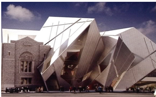
The Michael Lee-Chin Crystal at the Royal Ontario Museum in Toronto, Ontario, opened in June 2007.