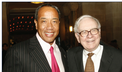
Michael Lee-Chin receives the Wealth Professional Award for Lifetime Achievement in the Financial Planning Industry from Wealth Professional