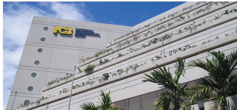
Portland acquires the National Commercial Bank Jamaica Limited in 2002.